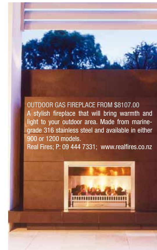
OUTDOOR GAS FIREPLACE FROM $8107.00 A stylish fireplace that will bring warmth and light to your outdoor area. Made from marine-grade 316 stainless steel and available in either 900 or 1200 models. Real Fires; P: 09 444 7331; www.realfires.co.nz