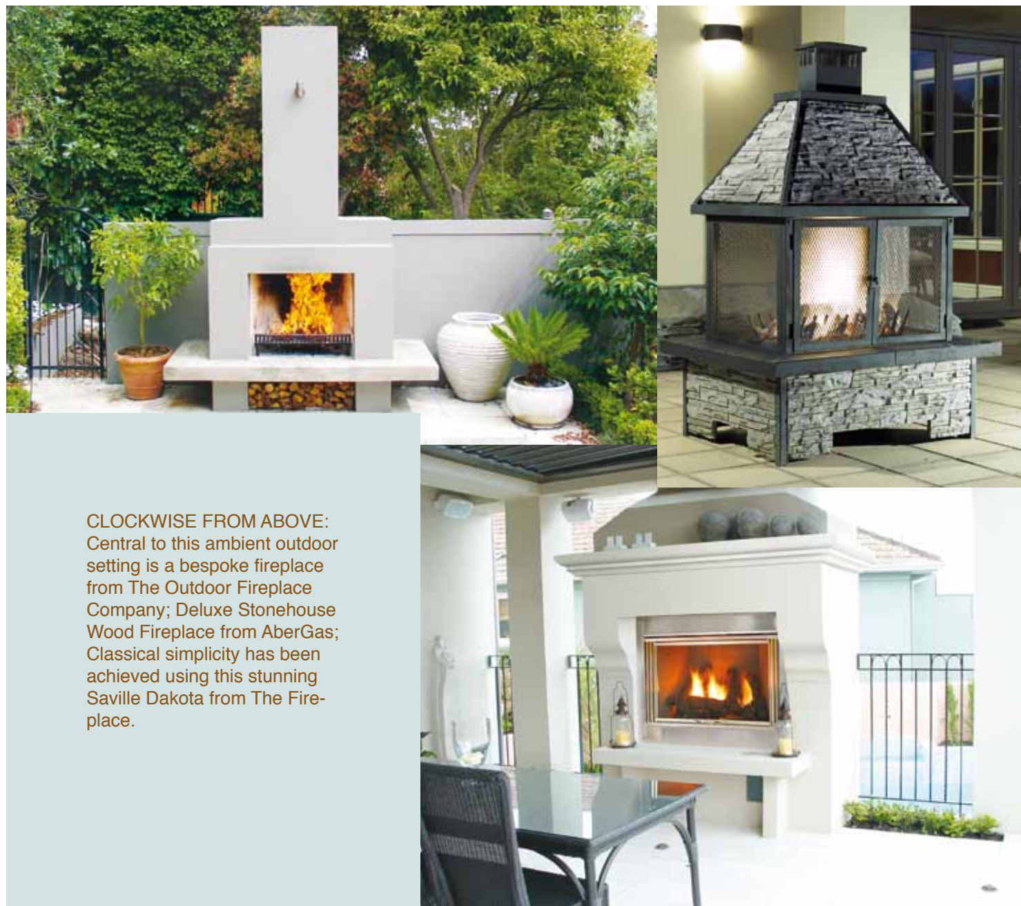
CLOCKWISE FROM ABOVE: Central to this ambient outdoor setting is a bespoke fireplace from The Outdoor Fireplace Company; Deluxe Stonehouse Wood Fireplace from AberGas; Classical simplicity has been achieved using this stunning Saville Dakota from The Fire-Place.

If you're looking for a permanent structure that creates the illusion of a flame fire, but with the convenience of gas, you may like to consider a through wall fireplace from Real Fires which can be enjoyed in two rooms – indoors or out – simultaneously.