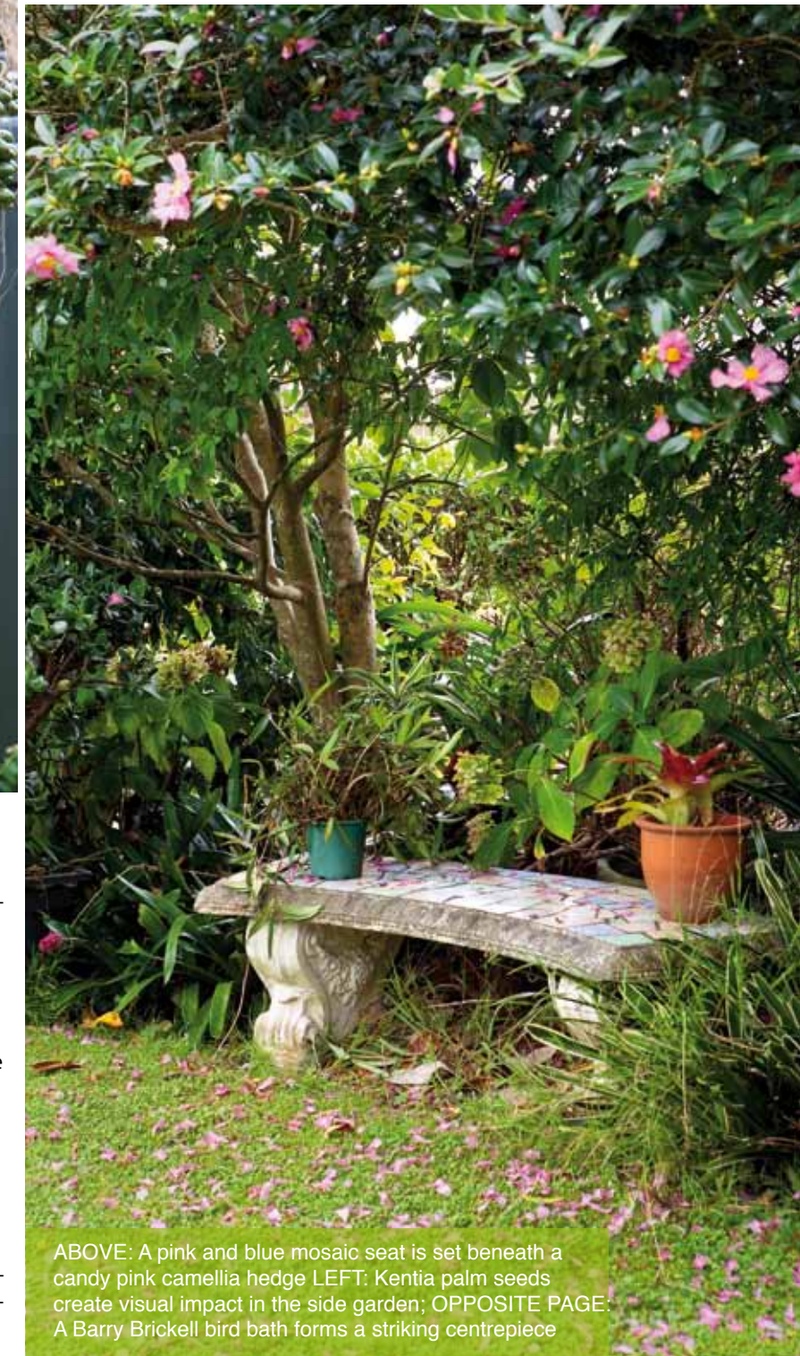
ABOVE: A pink and blue mosaic seat is set beneath a candy pink camellia hedge LEFT: Kentia palm seeds create visual impact in the side garden; OPPOSITE PAGE: A Barry Brickell bird bath forms a striking centrepiece

Behind the hedge, with its wrought-iron gate lending an air of mystery, the first row of bromeliads hunker down, squat and hardy. Great swathes of them, all types and colours, attractively grouped. The urn by which I was at first attracted lends a striking vertical element, echoed by a frangipani in flower and several sculptural groupings of hard-edged bluestone rock. Another stunning piece of oriental-inspired artwork shelters beside a weeping maple, under the umbrella of a mature puka. ➤